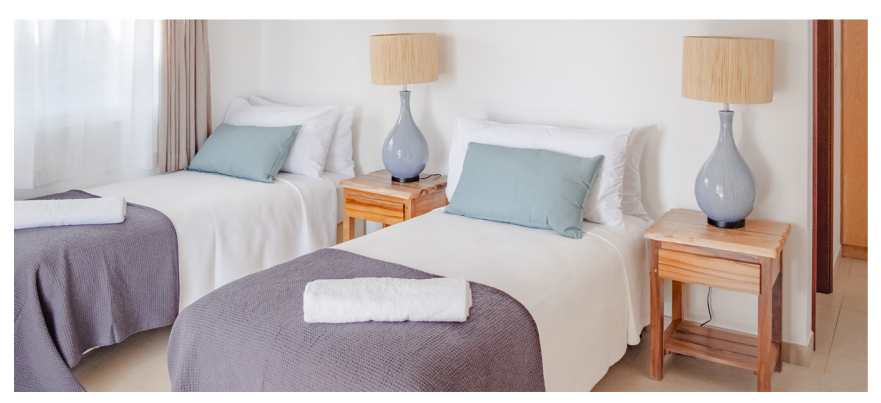
ESSENTIALS & AMENITIES Air-conditioned | Beach Towels | Indoor & Outdoor Shower L'Occitane Amenities | Wi-Fi | Yeti Coolers